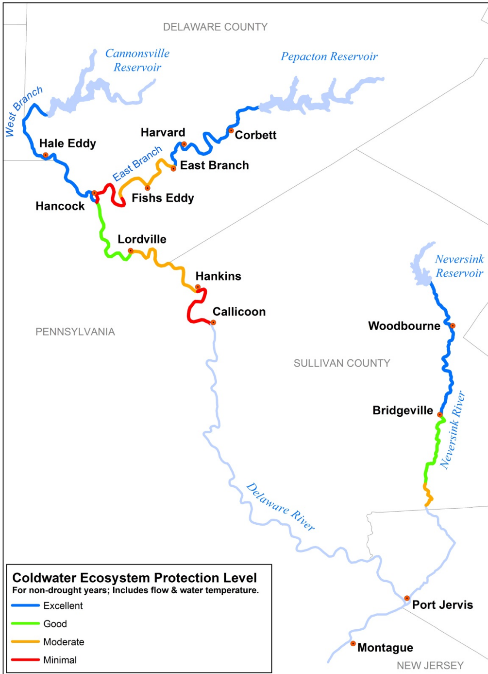
Plate 1 Extent and Protection Level of the Cold Water Ecosystem