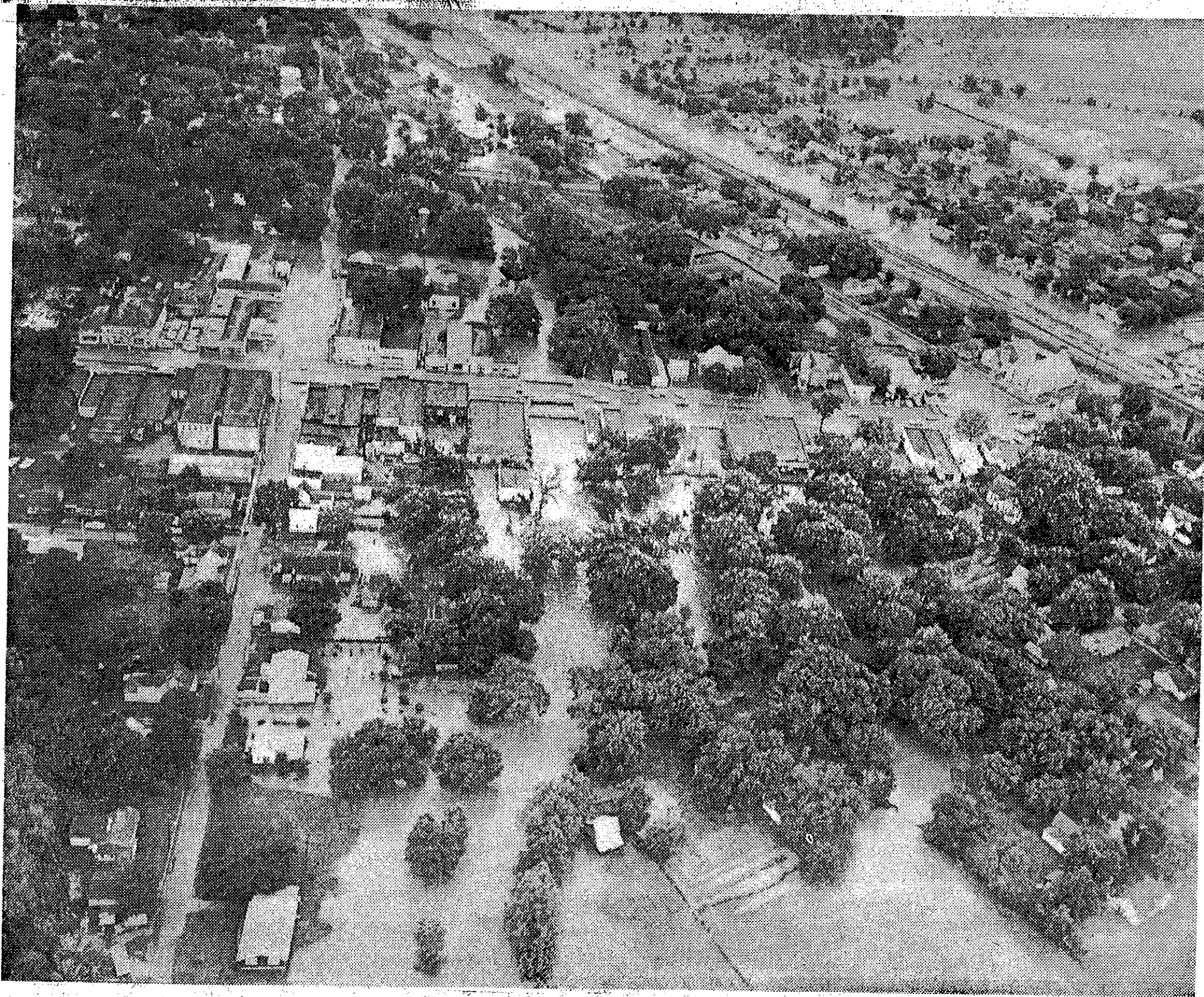
Flood waters stand around homes in Seneca, Mo., where more than 50 persons had to be evacuated when rains of up to 11 inches fell Saturday.