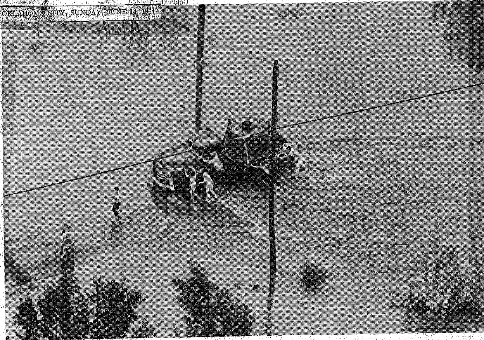
A truck stalled by flood waters gets push from volunteers in Commerce. More pictures Page 14-A.