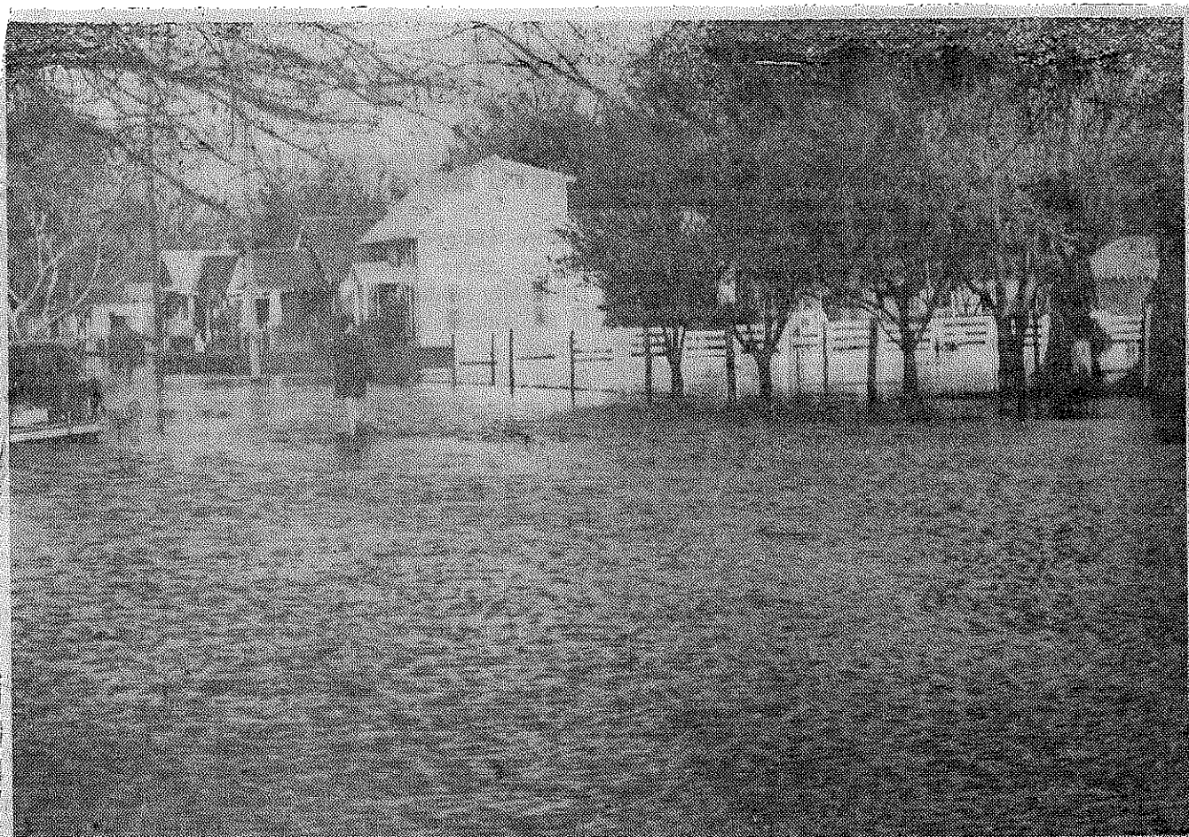
WADING DOWN PADEN STREET is this unidentified woman as the Chikaskia River flooded 40 square blocks of Blackwell's east and north residential districts.