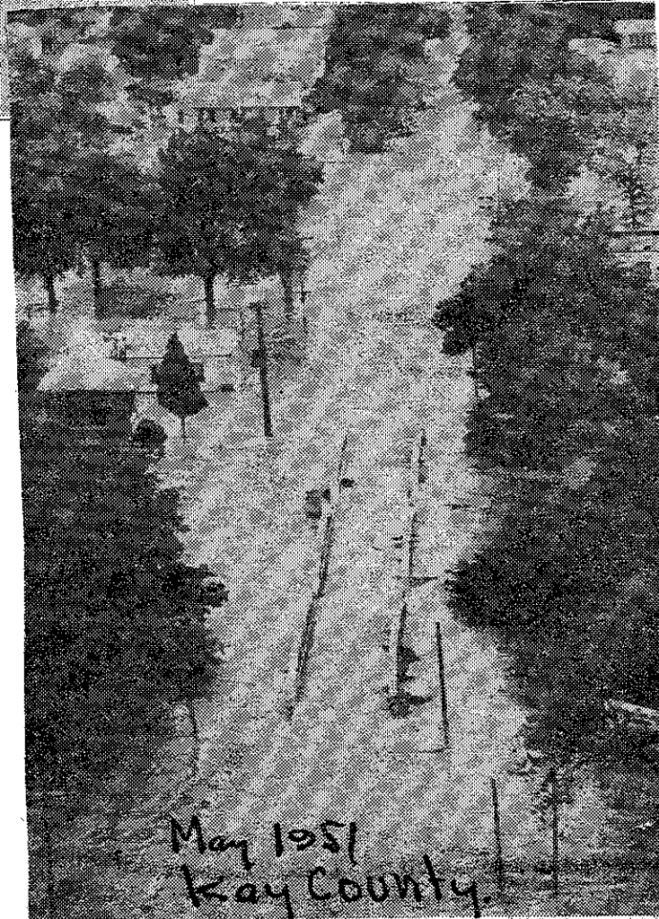
Floodwaters Saturday looked like this east of Blackwell, where a railroad track was barely distinguishable and a farm home was surrounded. More than 100 homes were flooded in Blackwell by the surging Chikaskia river.